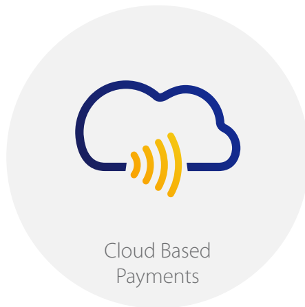
Cloud Based Payments